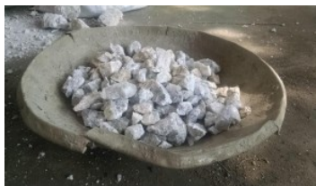
Fig 1 Limestone

Limestone is used in the construction industry in various applications including new structures and in restoration of historic stone monuments. Exposure to fire and high temperatures cause significant changes in the physical and mineralogical properties of limestone. The aim of this research is to propose a strategy to assess the fire and high temperature performance of limestone.