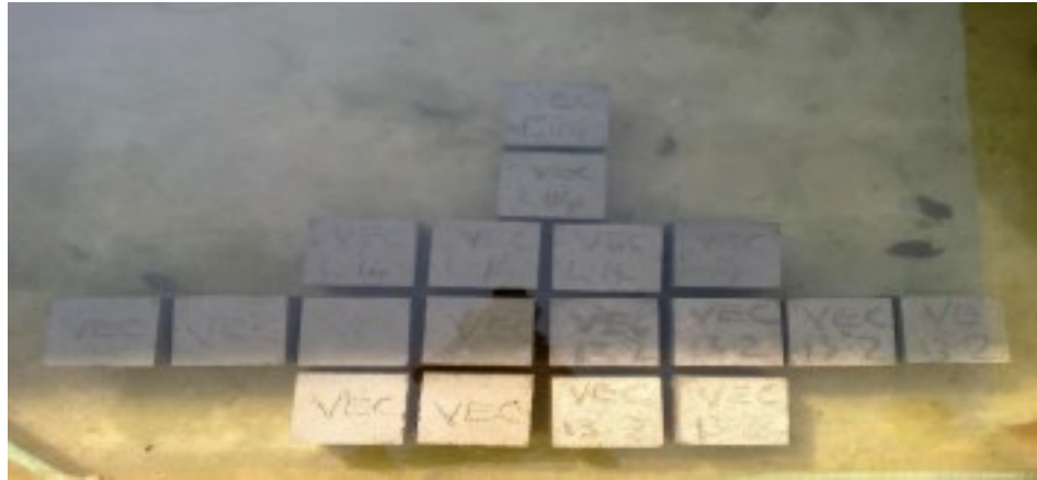
Fig 3 – Curing of cubes