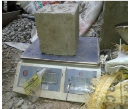
Fig 4- Weighing cube specimen