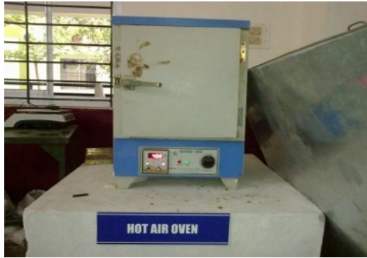
Fig 6 - Hot air oven at 400°C