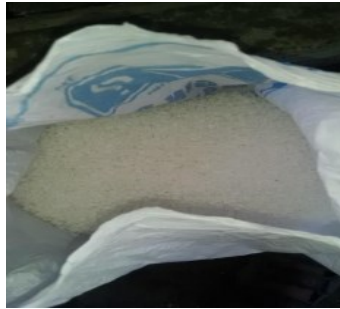
Fig 2 Polypropylene fiber