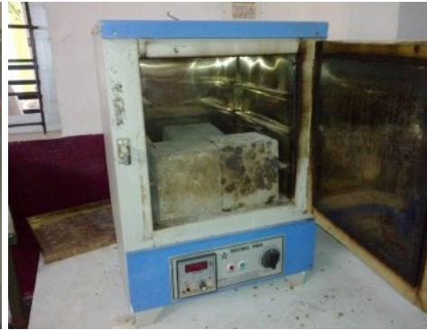
Fig 7 - cubes after exposing it to 400°C