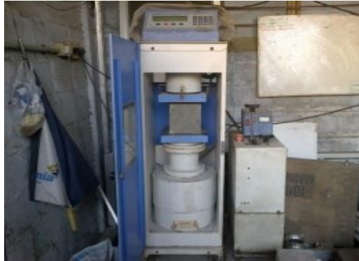
Fig 5 - Compression Testing Machine